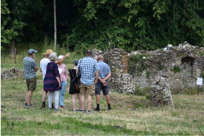
Visitors on a guided tour of Sibton Abbey ruin during the successful heritage weekend held in July

THE RAFFLE: If you wish, do bring raffle prizes, but in respect of the Islamic traditions of the Bangladeshi people, please no alcohol.