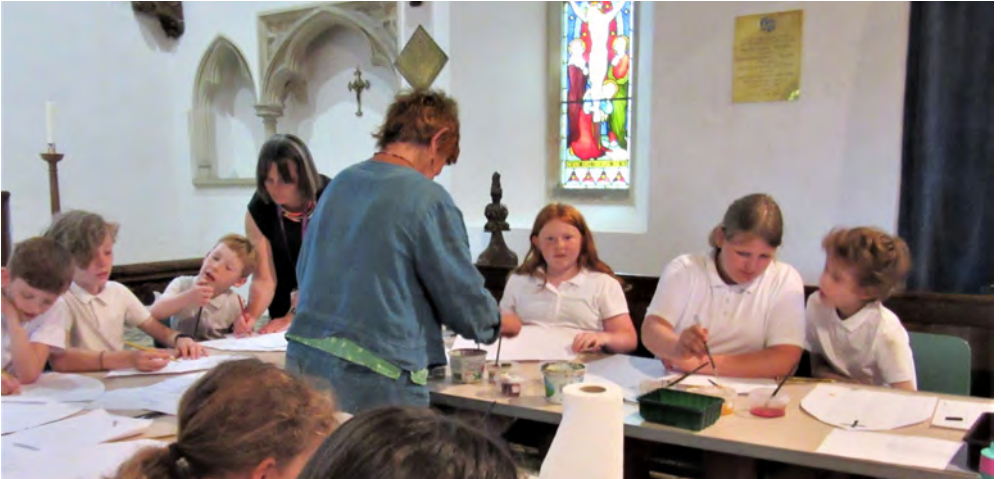
Children from Middleton School working on designs to display in St James Church, Dunwich. (See P.17.)