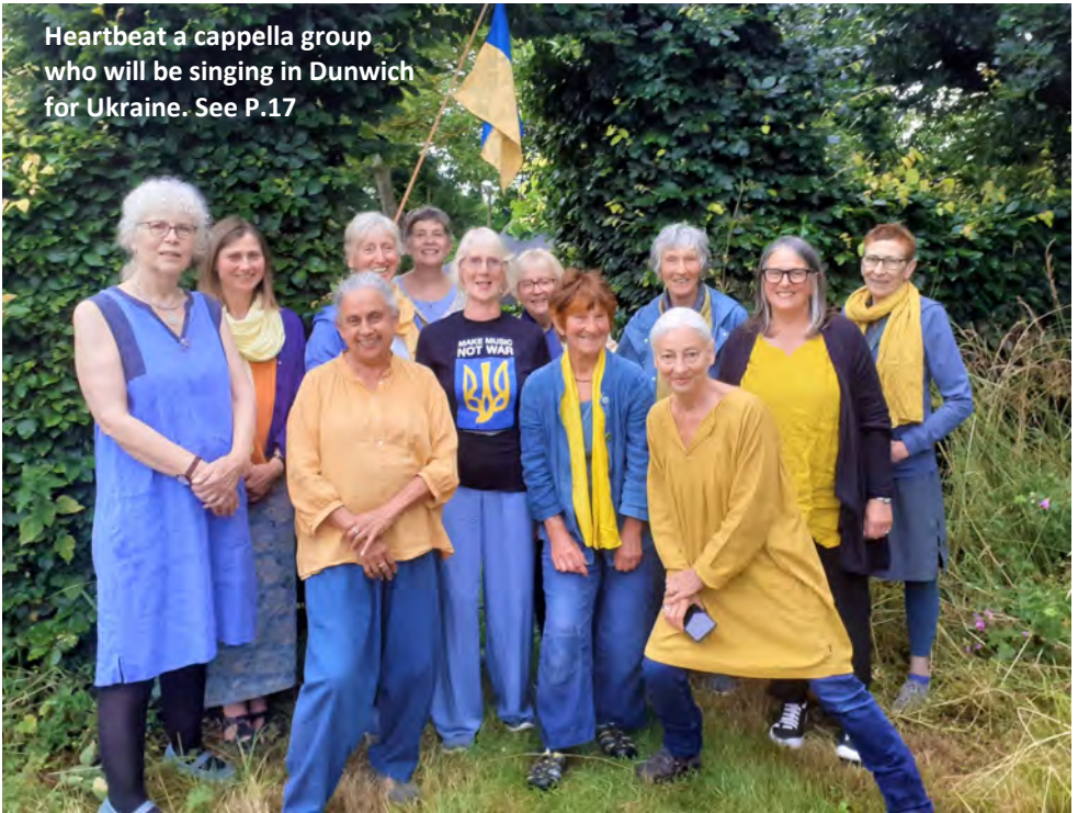
Heartbeat a cappella group who will be singing in Dunwich for Ukraine. See P.17