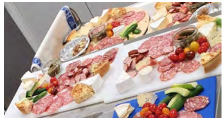
Photos from the "French Day" in Westleton, with music, dancing, wine, food (including snails), retro car trips, and more. Magnifique!