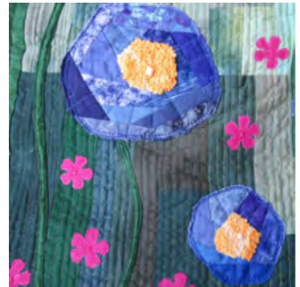
Textile art created by Majyk Scraps. See notice of exhibition on P.14.