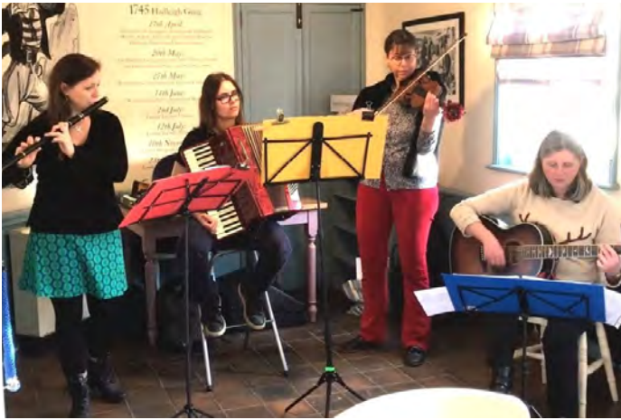
Left: Christmas music in the café, Dunwich Heath