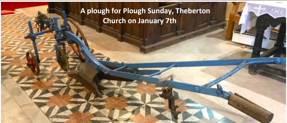
A plough for Plough Sunday, Theberton Church on January 7th