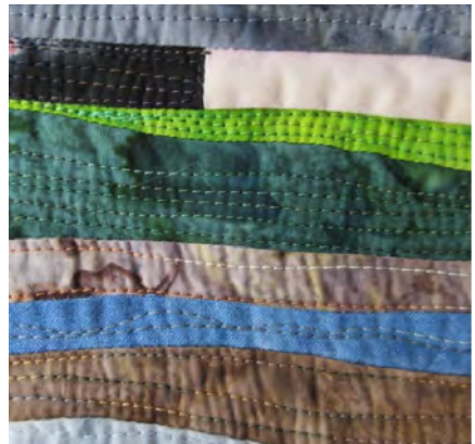
Textile art created by Majyk Scraps. See notice of exhibition on page 13