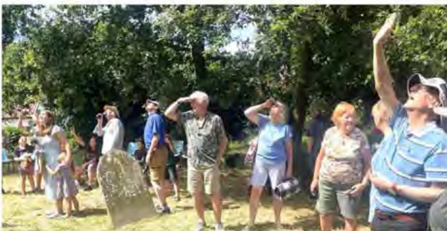
Is it a bird? Is it a plane? No, it's thirty teddies (and other animals) descending from Theberton church tower.