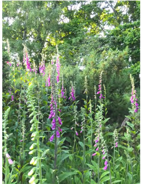
Above right Some of the sensational foxgloves flowering in profusion on Westleton Common