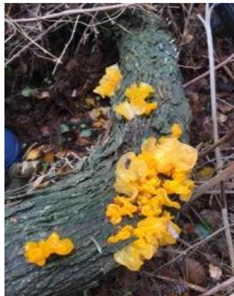
Yellow Brain Fungus