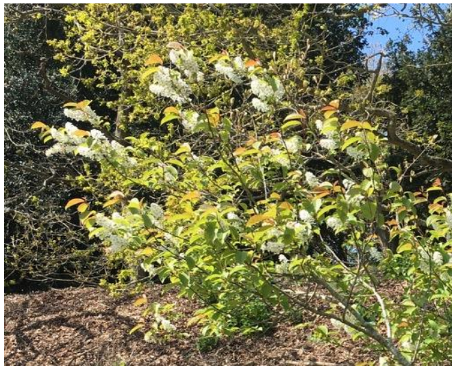
Bird Cherry tree in flower