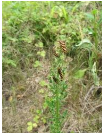
Cinnabar moth caterpillars feasting on Ragwort.