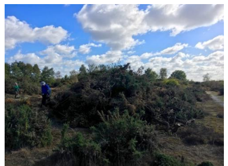
Big heap of cut gorse