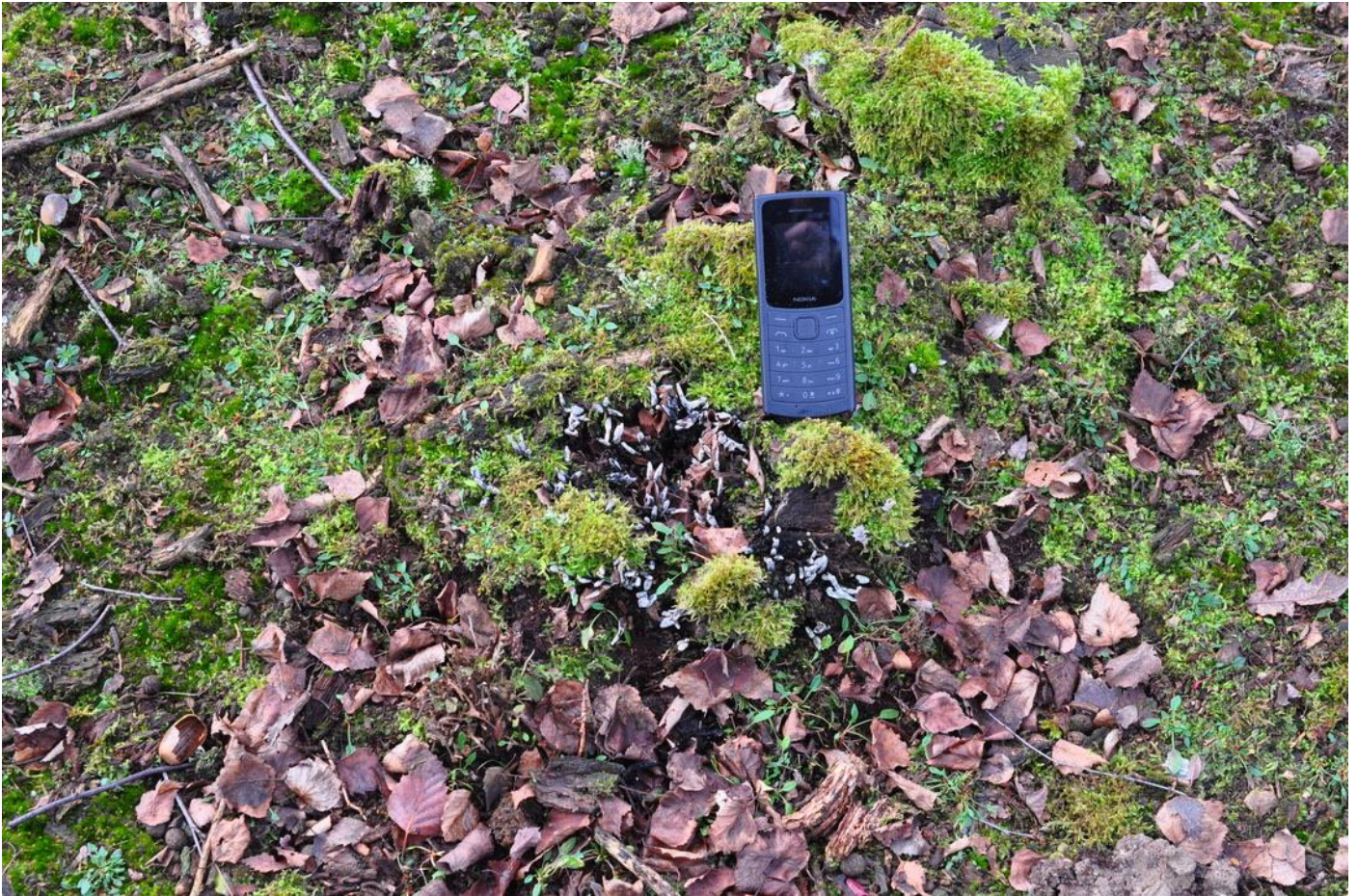
Xylaria cinerea fungus.