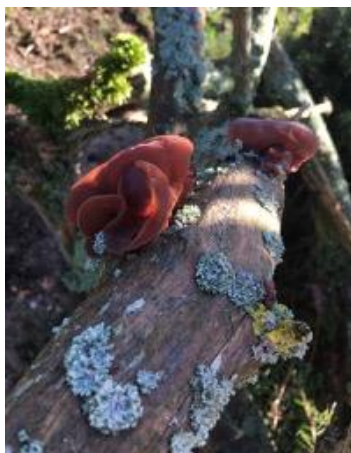
Ear Fungus on Elder