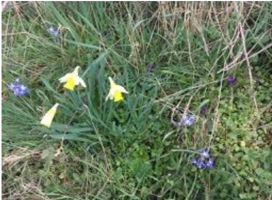
Daffodils and scillas