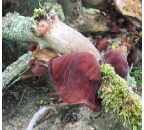
velvety Ear Fungus