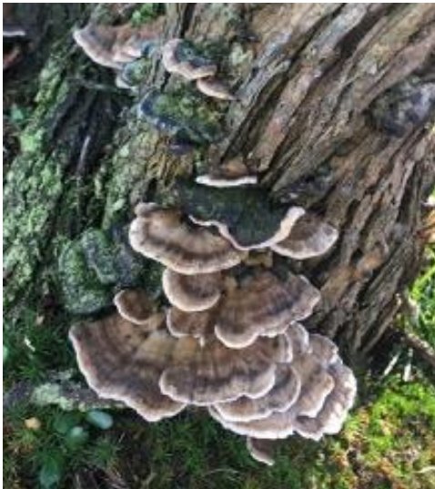
Turkey Tail fungus