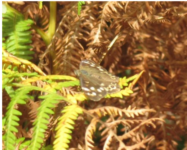
Speckled Wood butterfly