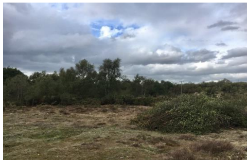
After and heap of cut material