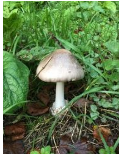
Deadly poisonous Death Cap