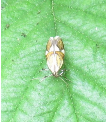
Micro-moth Nemapogon clematella

Chiff Chaffs and Chaffinches were heard, and there was a small chirp from a Nightingale.