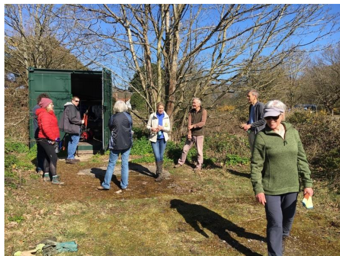
Time to go home