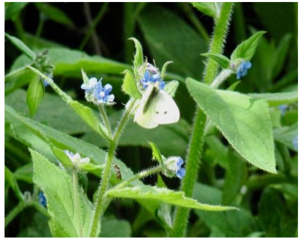
Common Storks Bill and Green Alcanet - with possibly a Green Veined White butterfly