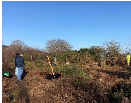
Nearing the end