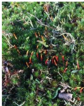
Polytrichum moss + female flowers