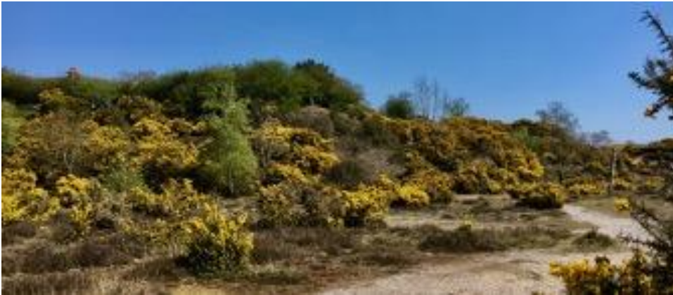
Gorse showing off