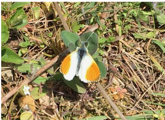
Orange Tip butterfly