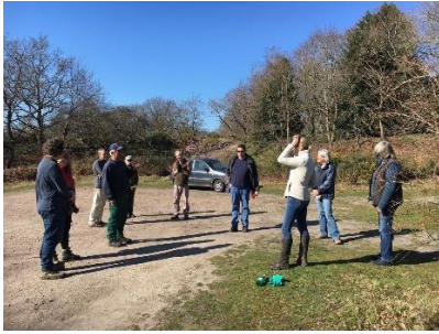
Thinking about starting