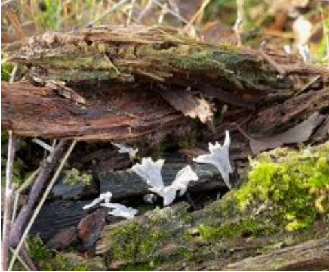
Candle Snuff fungus