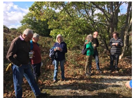
Still coffee break