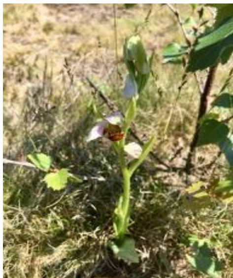
Bee Orchid in flower