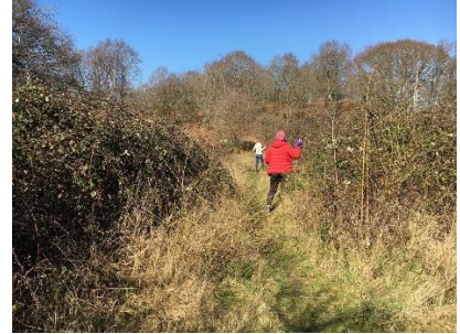
Still hard at work