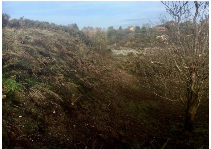
After - Juliet Bullimore