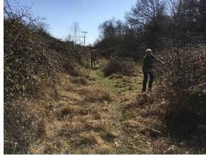
Hard at work