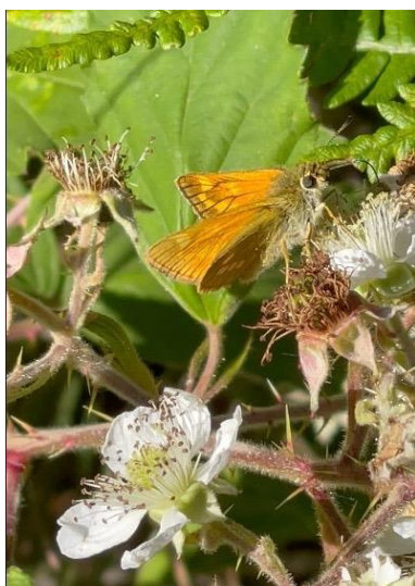
Small Skipper butterfly

Again, a list of what was seen on this day can be found in the Appendix.