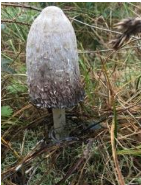
Shaggy Ink Cap

Here are some photos of what was seen during our Nature Walk: