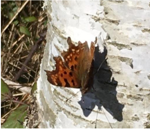
Comma butterfly (Peacock butterfly also seen)