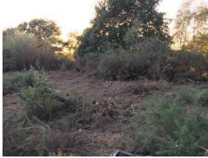
Completed work – photographed in the evening of Sunday 2 October