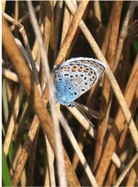
Silver Studded Blue butterfly