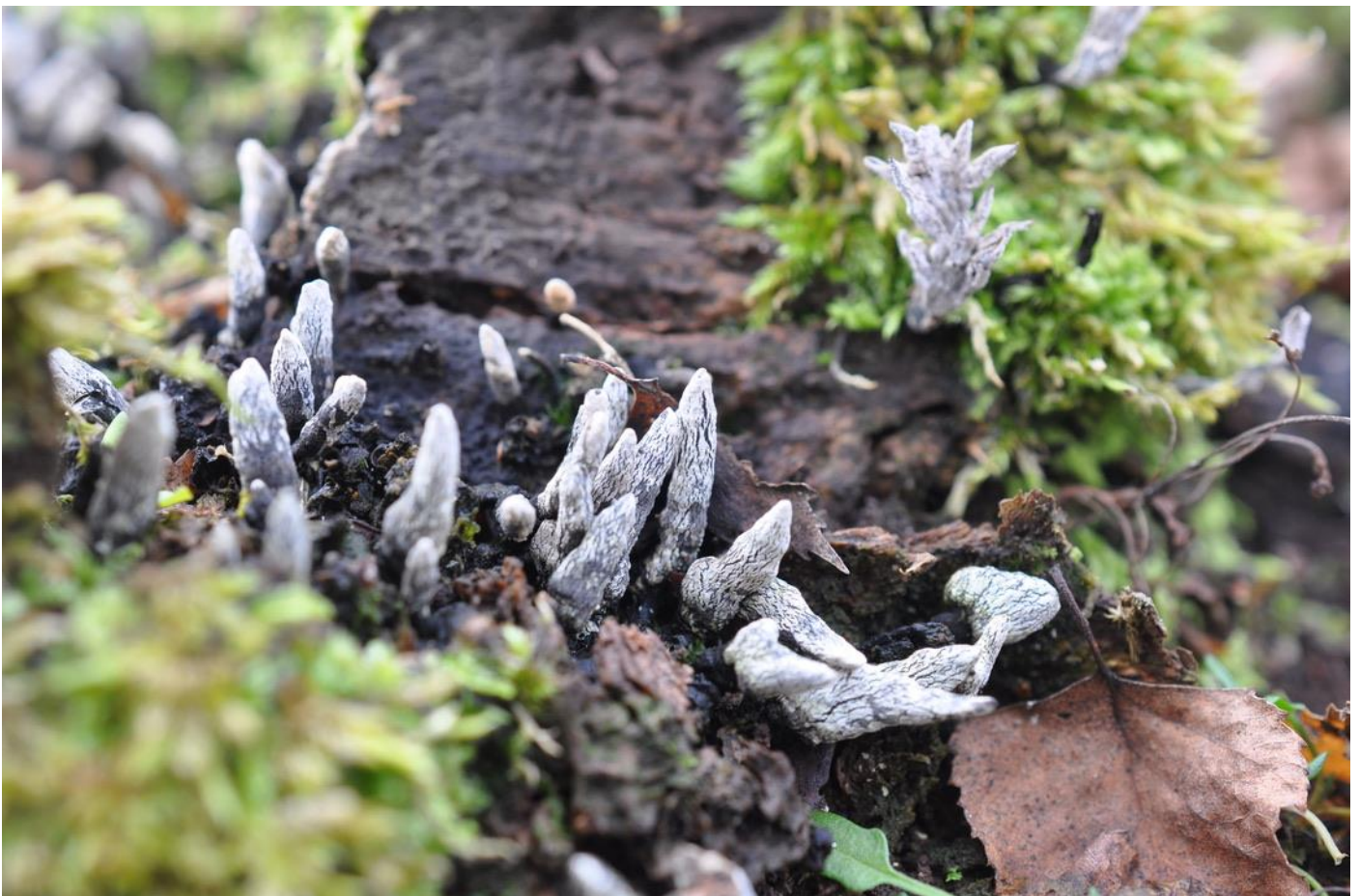
Neil Mahler - Xylaria cinerea fungus 2.