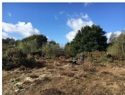
Still hard at work