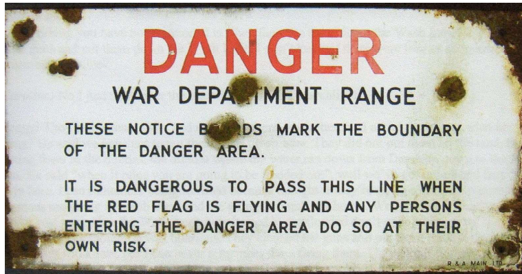
A wartime warning sign on the Common ( Sign Loaned by Ronnie Strowger )

During World War II, the Common was used as a camp by the Army. Signs of their occupation can still be seen near The Pheasantry and The Cleeves. There were no trees then on these areas, the rabbits kept all seedlings down. Concrete and brick bases for army huts and remains of boots can still be found. The sealed top of the well they dug is just visible beside the present-day tools container. They had a search light on the Noddle, observer posts, various target practice ranges, gun enclosures and trenches. Local children found a great many bullets and other artefacts to play with, sometimes with tragic consequences. Ammunition was stored at the edge of the northern boundary of the Common. The Officers were quartered in the Mill House, and all around the village.