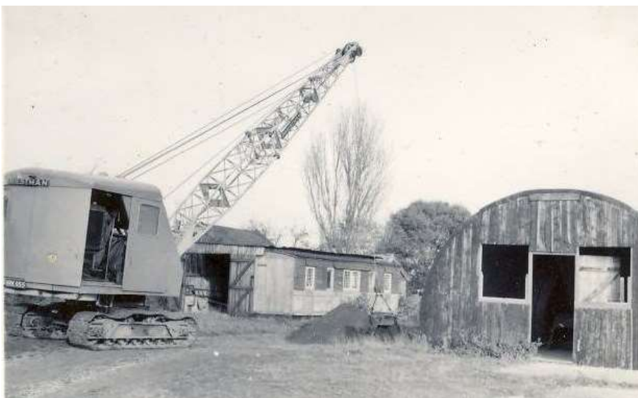
Nissen Hut, 1955, near Cleeves' Railway Carriage. Alf Fisk (The crane is trench digging, possibly for taking a water supply further into the pit.)

During World War II, the Common was used as a camp by the Army. Signs of their occupation can still be seen near The Pheasantry and The Cleeves. There were no trees then on these areas, the rabbits kept all seedlings down. Concrete and brick bases for army huts and remains of boots can still be found. The sealed top of the well they dug is just visible beside the present-day tools container. They had a search light on the Noddle, observer posts, various target practice ranges, gun enclosures and trenches. Local children found a great many bullets and other artefacts to play with, sometimes with tragic consequences. Ammunition was stored at the edge of the northern boundary of the Common. The Officers were quartered in the Mill House, and all around the village.