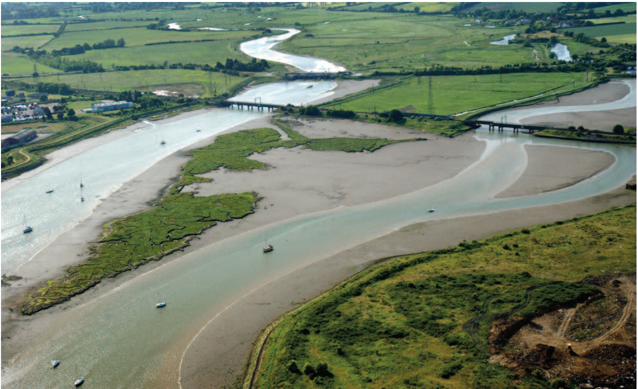
The River Stour at Cattawade: Part of the Dedham Vale AONB

If you need help to understand this information in another language please call 03456 066 067 .